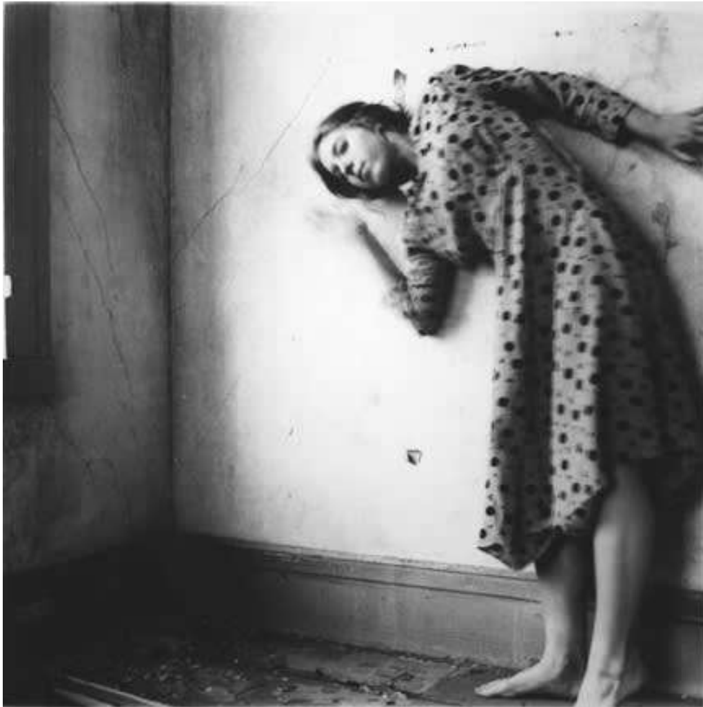
Untitled, from Polka Dots Series, Providence, Rhode Island 1976