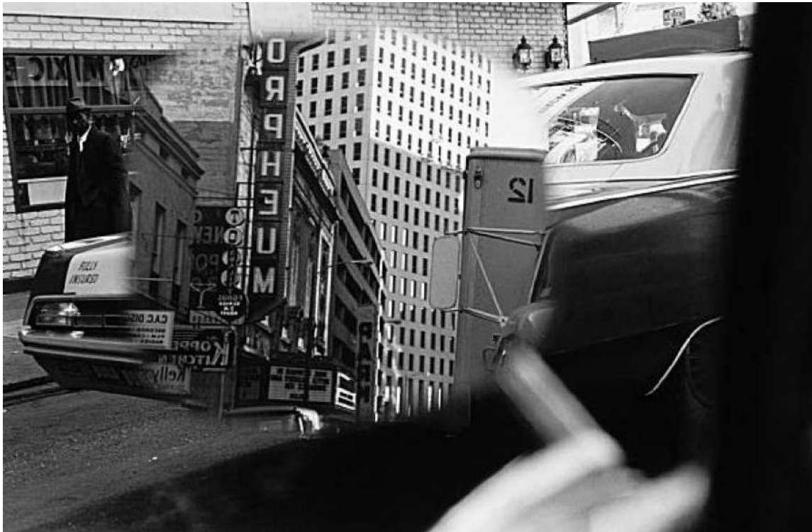
Lee Friedlander: New Orleans 1969