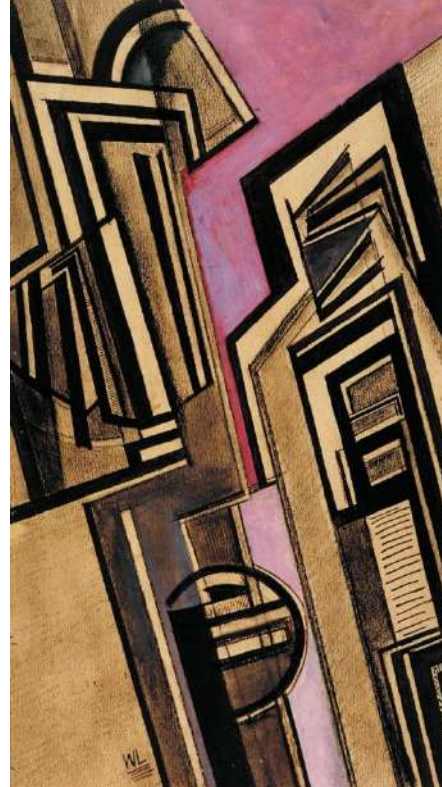
Vorticist Composition 1915