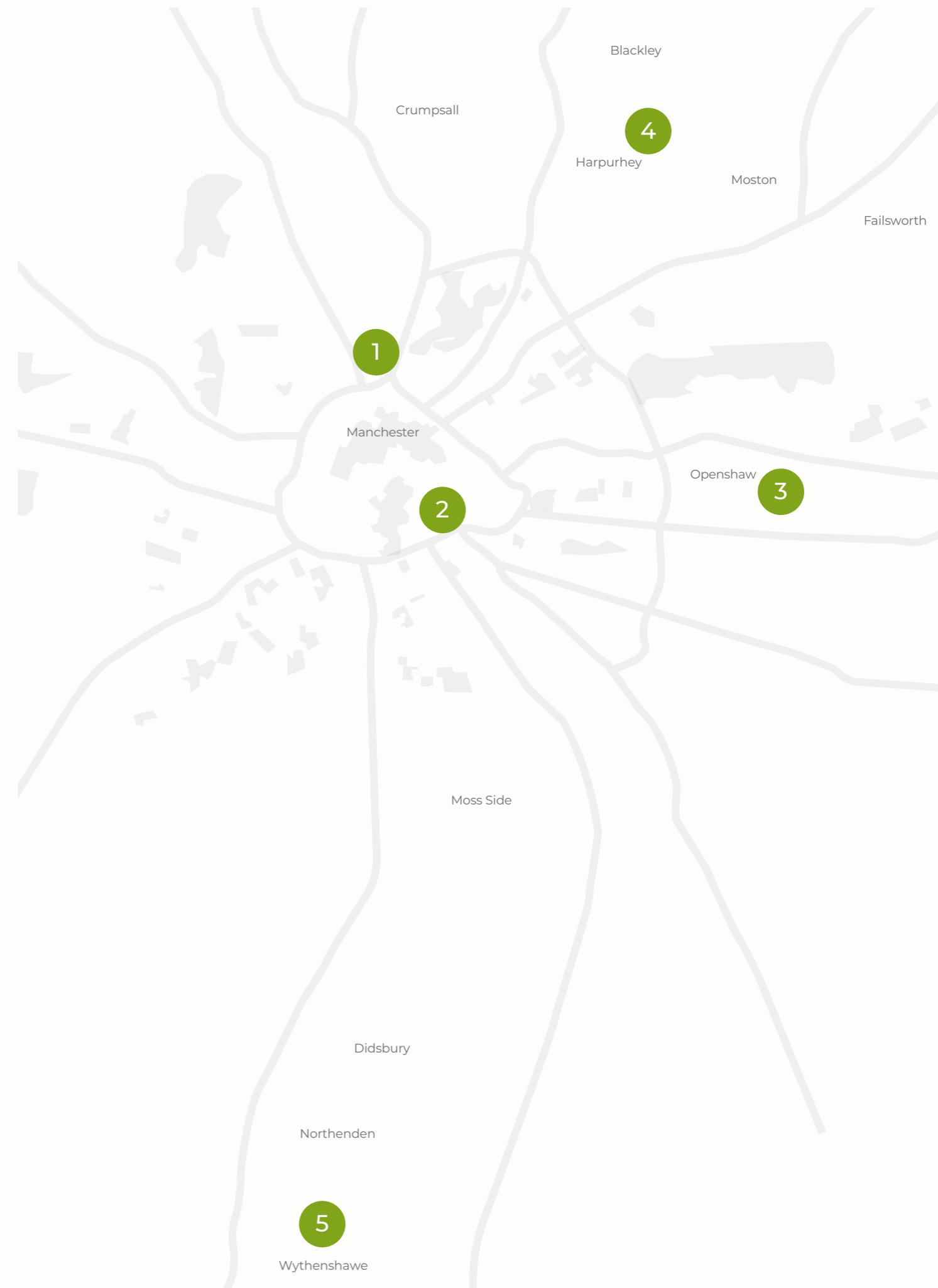
05. Wythenshawe Campus Brownley Road, Wythenshawe M22 9TG