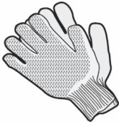
Gloves with staples

Safety Goggles: Why is it important to wear this type of PPE?