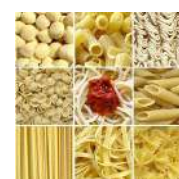
Any pasta or noodles