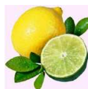
Lemons & Limes