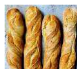
Any breads, wraps or bagels