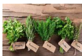
Any fresh herbs you like